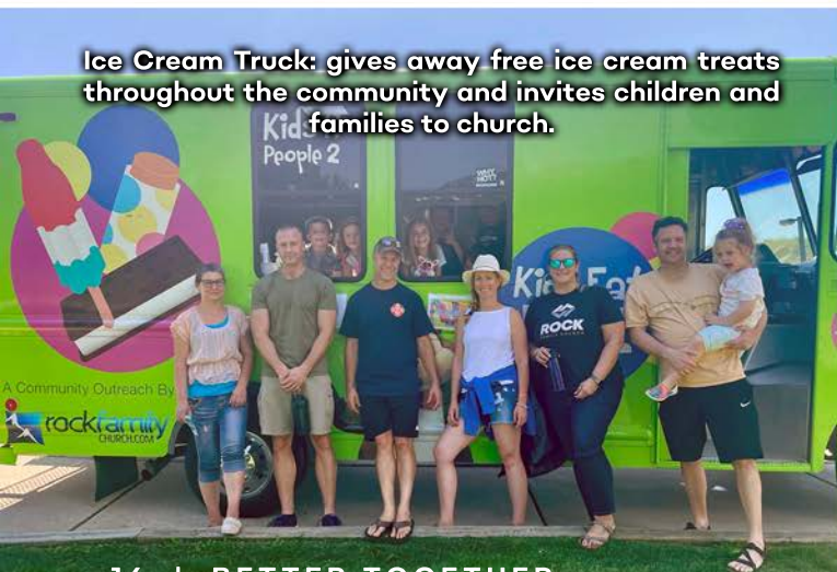
Ice Cream Truck: gives away free ice cream treats throughout the community and invites children and families to church.

Outreach is one of the cornerstones of what makes Rock unique. Through our community partners and events we do throughout the year, we are putting action to impacting every ONE with the love of Jesus Christ.