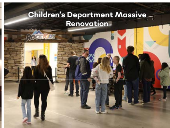
Children's Department Massive Renovation