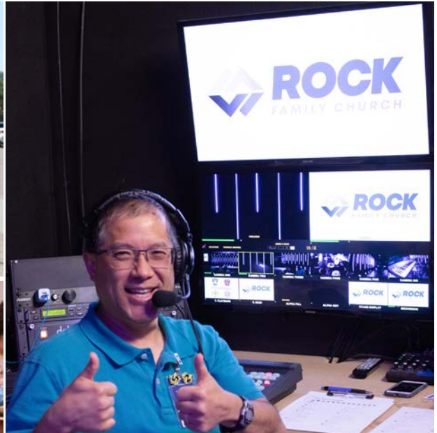
ROCKSTAR OF THE YEAR WAYNE - PRODUCTION TEAM