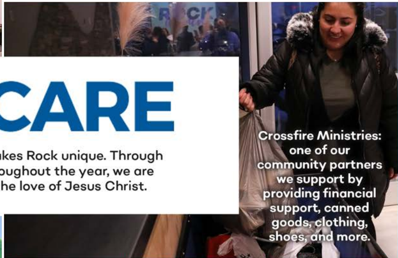
Crossfire Ministries: one of our community partners we support by providing financial support, canned goods, clothing, shoes, and more.