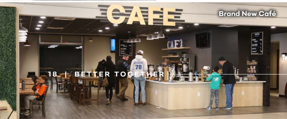
Brand New Café