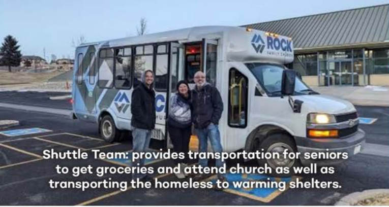
Shuttle Team: provides transportation for seniors to get groceries and attend church as well as transporting the homeless to warming shelters.

NATIONS WITH MISSIONARIES WE FINANCIALLY SUPPORT