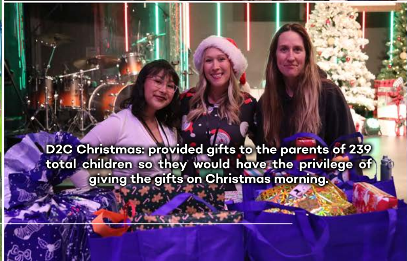
D2C Christmas: provided gifts to the parents of 239 total children so they would have the privilege of giving the gifts on Christmas morning.