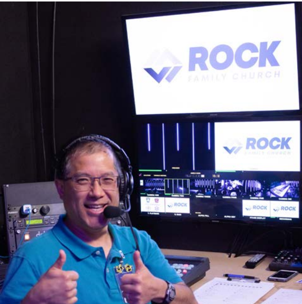
ROCKSTAR OF THE YEAR WAYNE - PRODUCTION TEAM